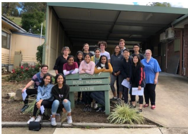
Medical students visit