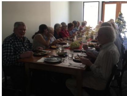
Community members at a Meals Program