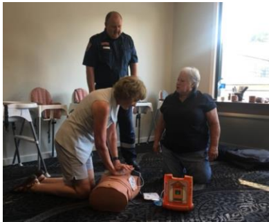
Facilitating a community education session

Bush nurses are adept at operating within extreme conditions such as bushfires, droughts and floods. They are at the forefront of working with ageing communities as young people leave the areas for work opportunities. In addition, they face funding issues whilst serving increasingly complex health needs. Time management is a challenge given the ratios of staffing to service areas. Bush nurses increasingly and by default, provide primary health care services in addition to their clinical roles.